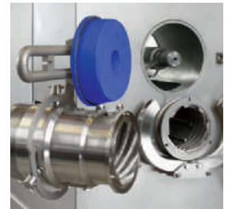
Unique hinged lining and plug for easy access and cleaning

As a result, blocks are cut rather than broken up, meaning almost no dust or fines are produced, particle definition is excellent and fat separation is reduced to an absolute minimum.