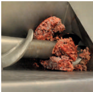
The slowly rotating feeder worm cuts frozen blocks rather than breaking them