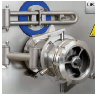
The grinding head