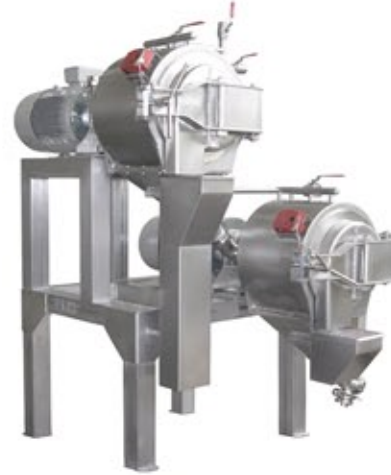
Double extraction group mod. PR40-2