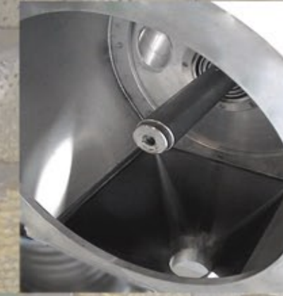
The puree extraction chamber without filter and rotor