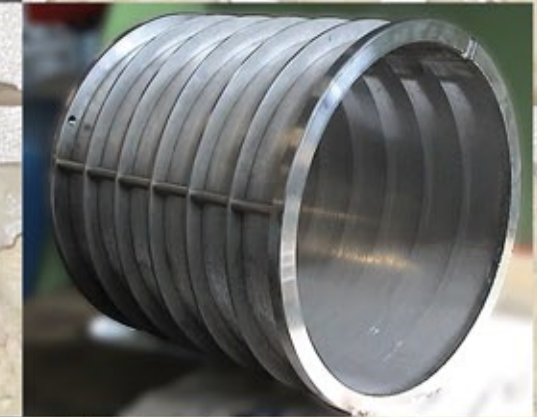
Basket complete with filter for Mod. PR40