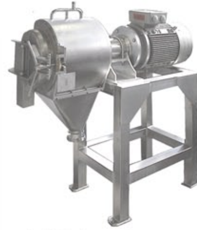
Individual extraction group mod. PR40-1