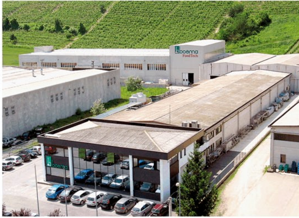
Boema S.p.A. factory

Extraction and refining group Mod. PR40 and PR40G