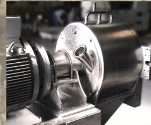
View of the PR40 from the product loading side