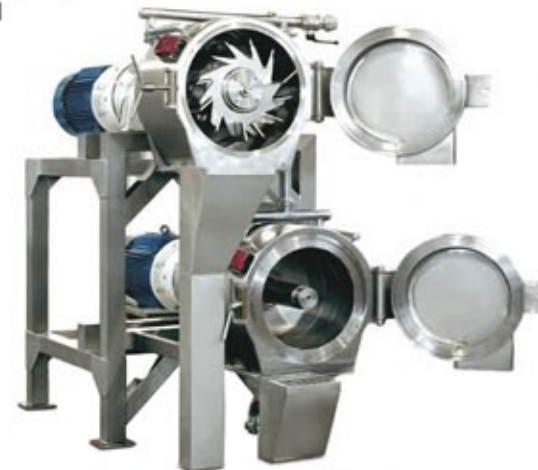
Double extraction group mod. PR40G2