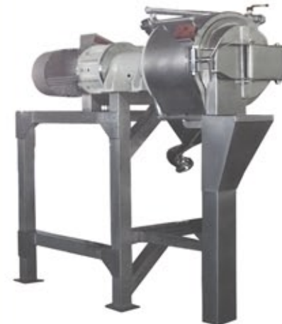
Individual extraction group mod. PR40G1