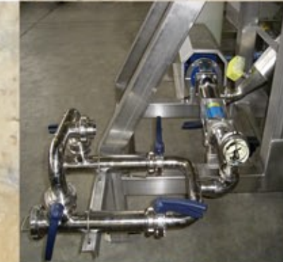
Monoscrew electropump for filters unit and safety pressure switch, installed on the extraction group discharge (accessories)