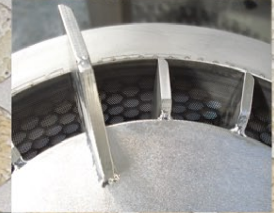
Detail of the rotor and filter in working position