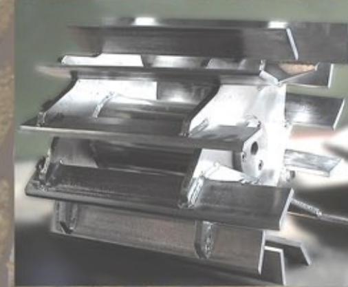
12 fix paddles rotor for Mod. PR40