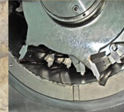
Detail of the three stages sectional rotor with disassembling paddles